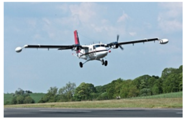
SGFEM is ...